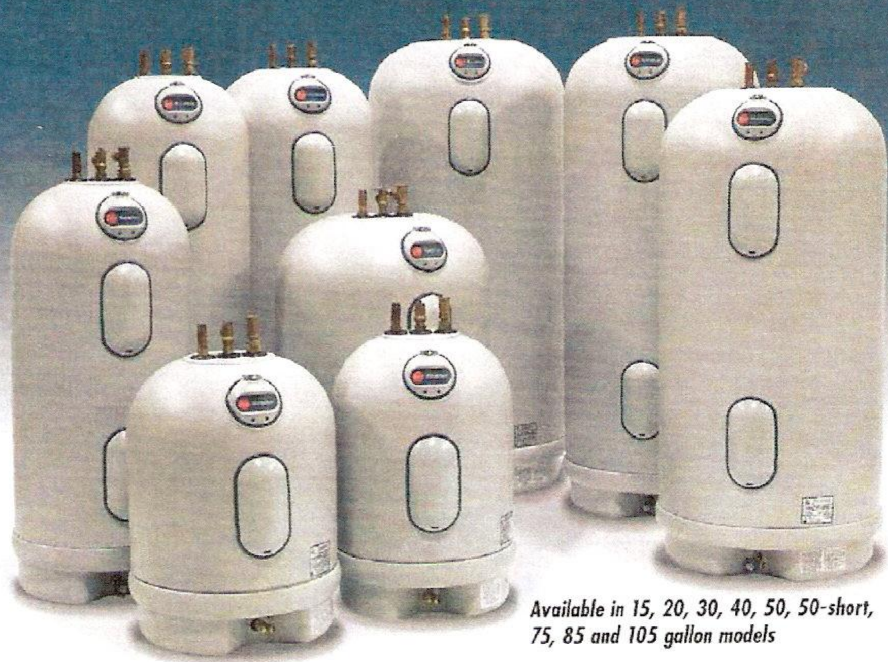
Available in 15, 20, 30, 40, 50, 50-short, 75, 85 and 105 gallon models